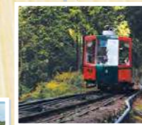
Fuku-go (Car No. 2)

Using the "well bucket" method to haul cable cars up the steep slope, a rope is attached to the cable cars and reeled in. The hoist is located at the mountaintop station, and a motor provides rotating force to reel the rope upward. In order to prevent the rope from slipping, it is wound around pulleys three and a half times in a figure-eight shape.