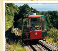
En-go (Car No. 1)