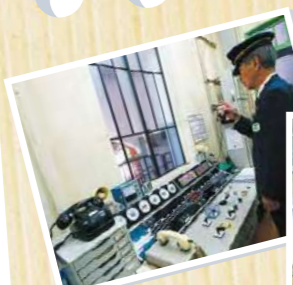
The hoist controls in the operator's room at Cable Enryakuji Station

Taisho-period (1912–1926) station buildings and rolling stock renovated in 1993 feature European-style designs with large windows for a romantic atmosphere reminiscent of Taisho-period Japan that puts the heart at ease. Train platforms are long staircases running alongside the cars. Enjoy passing over numerous bridges, various curves, a long tunnel and more. The seats face downward and away from the mountaintop, giving you the sense of being pulled upward from behind and superb views of the scenery below. All aboard!