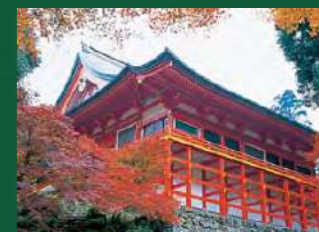
Yokawa Chudo Hall (Yokawa)