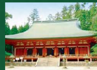
Shaka-do Hall (Sai-to)

Konpon Chudo Hall (To-do) of Enryakuji Temple. Enryakuji Temple, a UNESCO World Heritage Site, was established by Dengyo Daishi and is the head temple of the Tendai sect of Buddhism. Temple buildings are scattered around the mountain in the three areas of To-do ("East Pagoda"), Sai-to ("West Pagoda") and Yokawa, and known collectively as Hieizan Enryakuji Temple.